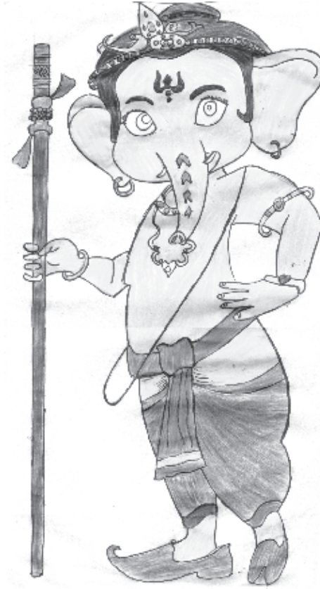
Jain Utsav Rajeshbhai - 6th